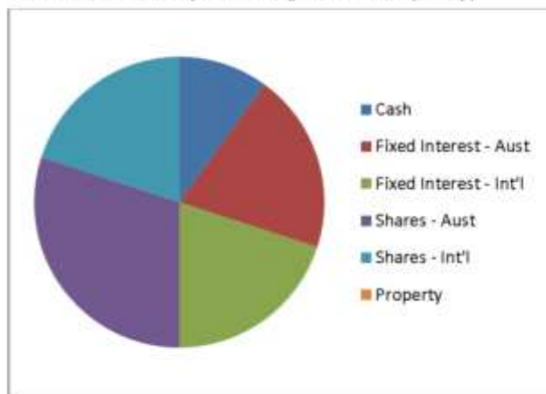
Asset Allocation (excluding Direct Property)